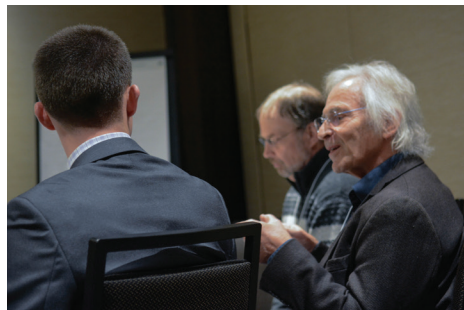
Small group breakout sessions.