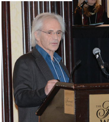
Gairdner Award-winner Sir Marc Feldmann gives his keynote address: "Beyond anti-TNF therapy for RA: can we get closer to a cure?"